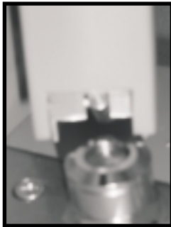
Figure 2a: Door placed on top of 218 Pivot.

Slide the door over the 218 Pivot, which is attached to the bottom of the door frame, see Figures 2a and 2b. Then, while the door is resting on the 218 Bottom Pivot, tilt the door, so that the opening in the top Centering Bracket fits into the main spindle located at the top of the door frame.