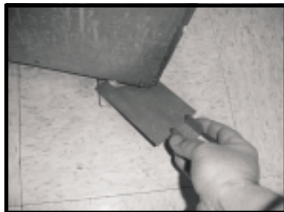
Figure 3: Height adjustment of door.

Adjust the height of the door with the special Adjustment Tool provided in the Closer Package. See Figure 3.