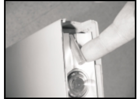
Figure 1b: 218 Pivot in bottom of door.