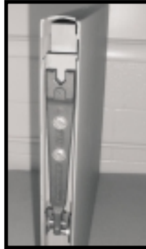
Figure 1a: Centering Bracket in top of door.

Attach the centering Bracket to the top of the door as shown in Figure 1a and attach the 218 Pivot to the bottom of the door as shown in Figure 1b.